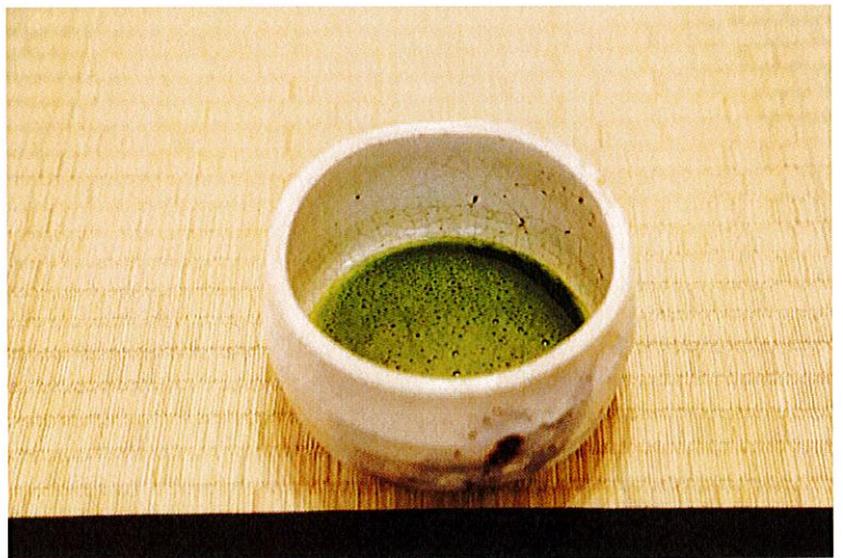
Japanese Tea Making Experience