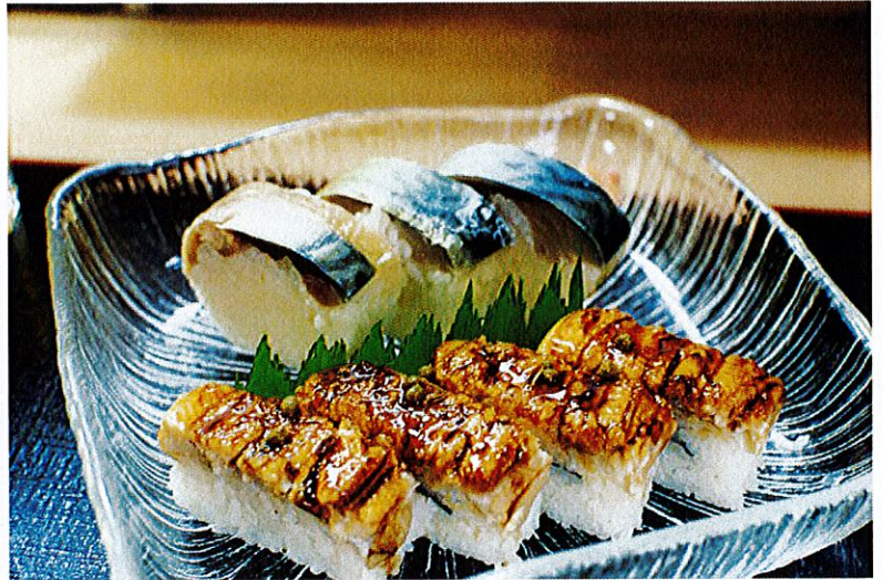
Mackerel and eel sushi in Kyoto