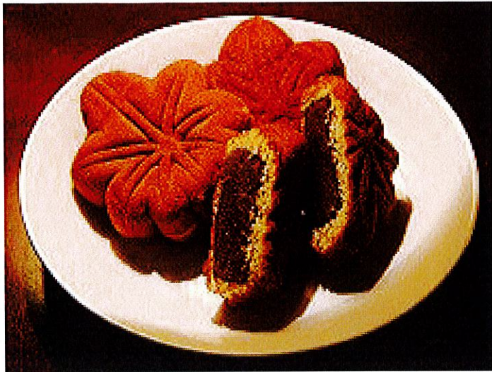
Momiji Manju in Hiroshima